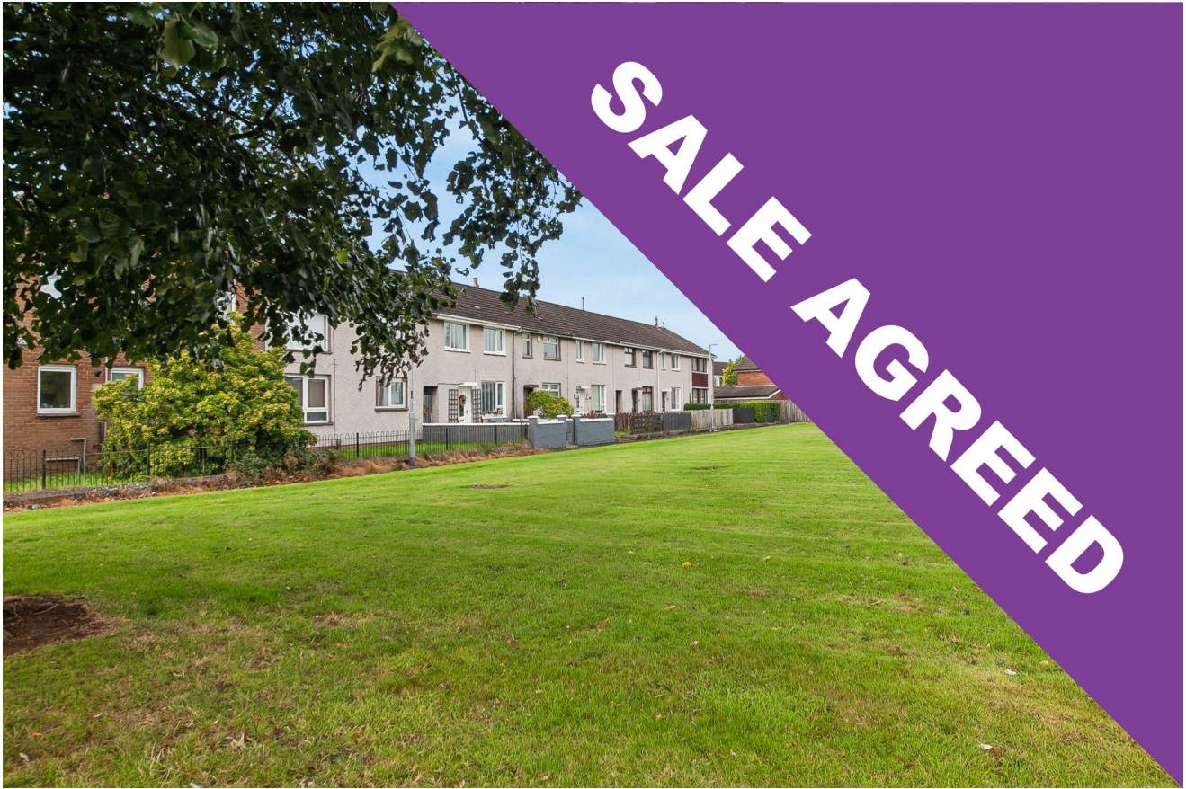
26 Glenvarna Drive, Newtownabbey, BT36 5JQ